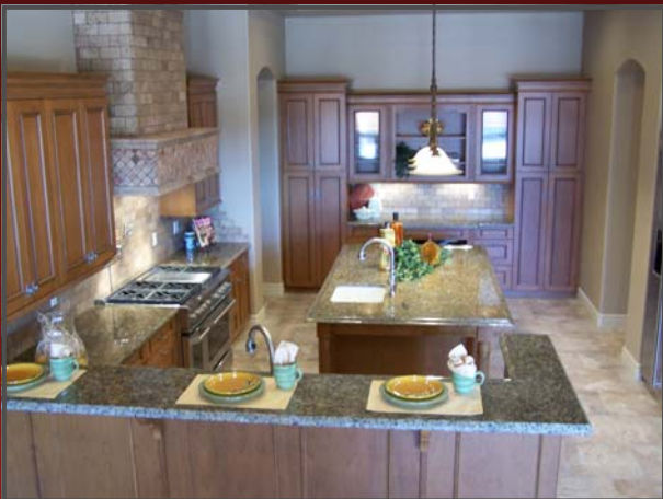
3159 East Portola Valley Court Whitewing at Higley Estates Gilbert, Arizona

At nearly 5,600 square feet with 6 bedrooms, 6 and ½ baths, an exercise room, a "teen room" and a 5 car garage, this home has room for everyone! Bedroom 6 is an attached casita with a private bath and beverage station and overlooks the rear courtyard. The west wing of the main house is comprised of 3 bedrooms each with a private bath and walk-in closet and a "teen room" that can be used as a play, computer or sitting room. The master, situated on the east wing, is adjacent to a room that could be used as either an exercise room or study. A wall of tile adorns the snail shower creating a dramatic focal point in the master bathroom. A wine room and a butler's pantry are just steps away from the dining room which could also serve as a billiard room. Finely finished with wood windows, 8 foot stained Alder doors, granite and natural stone, custom crafted Cherry cabinets and a designer lighting package. Situated on a large pool-size lot, this courtyard style home has views of the San Tan Mountains! In the gated community of Whitewing Estates , this home is just minutes from the Main Street Commons, San Tan Village Shopping Center, Gilbert Mercy Medical Center & the 202 Freeway. Another fine custom home by Mark of Excellence Builders . Call The Tipton Team at (480) 216-2644 to schedule a private tour!